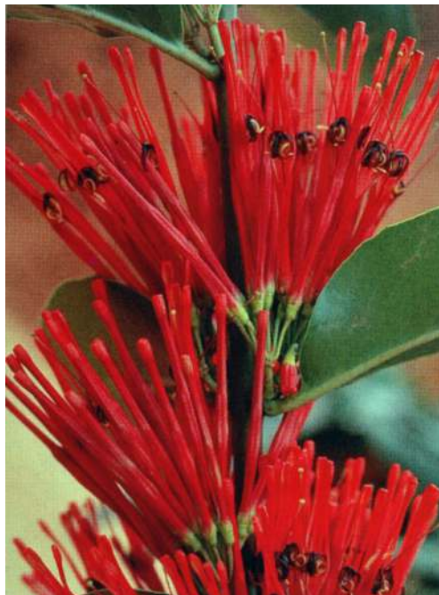
Englerina gabonensis

In a search of my Endnote reference database that contains all of the citations listed in past Haustorium newsletters the name Loranthus micranthus was used in the following journals: African Journal of Biotechnology, American Journal of Pharmacology and Toxicology, Asian Journal of Biomedical and Pharmaceutical Sciences, Asian Pacific Journal of Tropical Medicine, Bio-Research, Current Research, Drug plants, European Journal of Medicinal Plants, Fitoterapia, International Journal of Pharma and Bio Sciences, Journal of Ethnopharmacology, Journal of Pharmacy and Pharmacology, Journal of Tropical Medicine, Pharmaceutical Biology, and Phytopharmacology and Therapeutic Values. I then searched for this binomial using Google Scholar and added the following journals: Biochemistry Research International, Current Research Journal of Biological Sciences, Evidence-Based Complementary and Alternative Medicine, Global Advanced Research Journal, Journal of Pharma and Bio Sciences, Journal of Pharmaceutical and Allied Sciences, Natural Product Research (Formerly Natural Product Letters), Pharmaceutical Biology, Phytochemistry Letters, Planta Medica, Research Journal of Medicinal Plant, and Scientia Africana. Although some of these journals are from developing nations, others are from the United States and Europe, demonstrating that this taxonomic problem is not being detected among a wide range of authors, journals, reviewers, and editors.