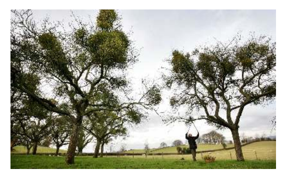
Mistletoe being collected from trees near Tenbury Wells in Worcestershire.

Mistletoe brings green life to the bare trees of winter and is a symbol of fertility and renewal in the darkest days of the year. Mistletoe gains part of the nutrition it needs through stealing nutrients and water from its host plant. In the case of the European Mistletoe ( Viscum album ), apple, hawthorn and poplar trees are the preferred hosts, but it is known to grow on many other species too. It gains the nutrients and water it needs by both photosynthesising and by sending specialised roots called haustoria deep into its host tree's vascular tissue.