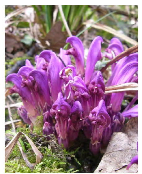
A mat of purple toothwort flowering at the base of a tree is a sight to behold.

more than 90 different genera (only three of which are not parasitic). Some of them make excellent garden plants if you can provide the right conditions and hosts to allow them to establish themselves.