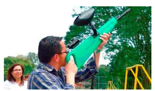
A prototype of the mistletoe-killing gun.

While most of us may just associate mistletoe with Christmas parties, the fact is that it can be a nuisance in the wild. It's a parasitic plant (a group of plants, actually) that grows in trees or shrubs, penetrating their branches to absorb water and nutrients. In sufficient numbers, mistletoe plants can actually kill their host. That's why scientists are taking the offensive, with a system that shoots herbicide up into trees' high branches.