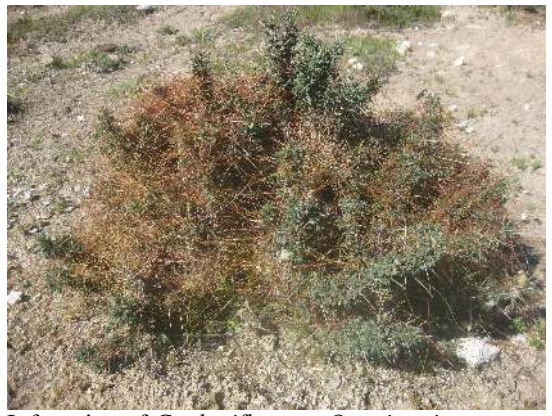
Infestation of C. planiflora on Ononis spinosa .

Cuscuta planiflora Ten. (red or small-seeded dodder) is an annual parasitic plant. It has recently become invasive in west of Iran. Its major areas of infestation are in Ilam province between southern parts of the highlands of Zagros mountain and tropical areas with range into neighbouring provinces like Khuzestan and Kermanshah. It is gradually increasing in natural landscapes and parasitizing many broadleaf plant species from different families including Asteraceae (Centaurea sp. Echinops sp.), Brassicaceae (Brassica spp., Diplotaxis harra), Geraniaceae (Erodium sp.), Papilionaceae (e.g. Astragalus spp., Ononis sp.) Polygonaceae and (Rumex ephedroides). The infestation is so high that host plants are affected (Taab, personal observations).