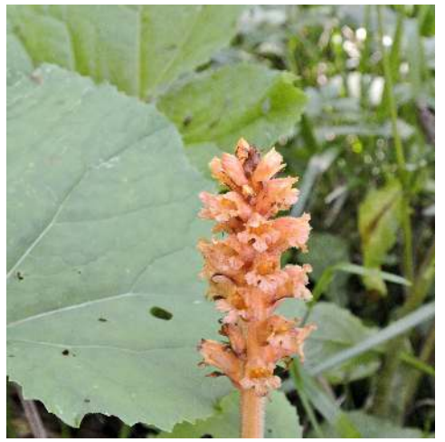
Orobanche flava on Petasites ?kablikianus .

An enjoyable post-conference tour took us to Demänovská Valley in the second highest Slovak mountain range 'Low Tatras' - along the creek Demäňovka. The aim of the tour was particularly to observe natural populations of Orobanche flava , and evaluate their impact on the host plant, a white-flowered butterbur ( Petasites kablikianus or perhaps P. albus ). O. flava is one of many wild broomrapes, interesting also because its seeds do not react to GR24. Other parasites observed included a Melampyrum species, either Melampyrum pratense or M. sylvatica and a Euphrasia sp.; also the mycoheterotrophs Neottia nidus-avis and Monotropa uniflora .