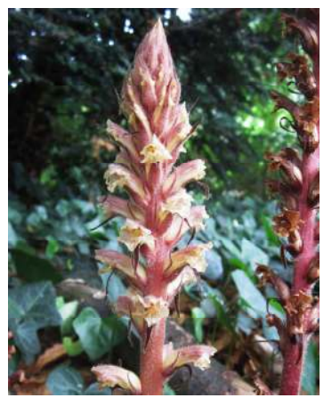
Ivy broomrape is one of the most seductive of the plant parasites.

Purple toothwort (Lathraea clandestina), also in the Orobanchaceae, prefers to attach itself to the roots of willow and alder but will grow happily on a range of hosts. It can take 10 years to flower if grown from seed but can also be introduced to a garden by being transplanted if you are quick about it. To see a mat of this plant in full flower at the base of a tree is quite a sight to behold. But true broomrapes (Orobanche and Cistanche spp.) are in my opinion the most seductive of these vampires of the plant world. Looking like tatty orchids, they come in the most unusual range of colours from bright yellow through to muted burned tones and the most crystal clear of whites. As they lack leaves, they seem to stand out in a way that few other plants do in a garden. Some, like the ivy broomrape (Orobanche hederae ), are little trouble to grow, but be careful with others, as some species can be problematic for agricultural crops and while not killing their host (as this would kill themselves) they can cause severe reduction in crop productivity. It is with this warning that I leave you to mull over growing some of these most unusual of plants, whose lives are so attached to the lives of others, and to think about the mistletoe above your heads and the incredible feat of evolution that allows some plants this strange strategy for survival.