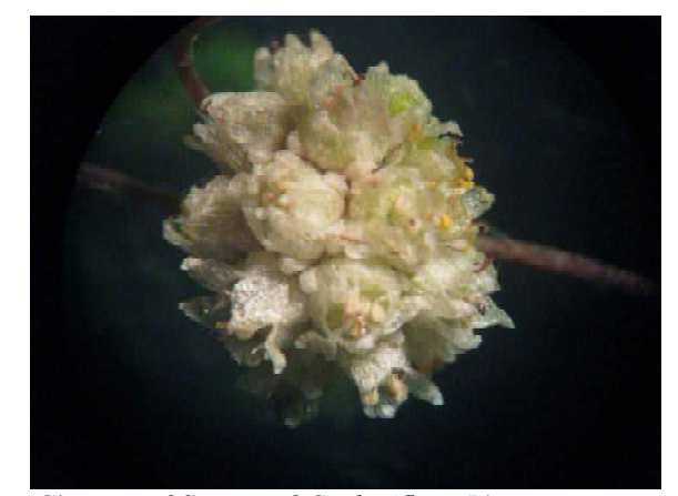
Close-up of flowers of C. planiflora .

natural processes (Dawson et al. 1994). The optimum temperature for seed germination of Cuscuta spp. was found to be between 30 to 33°C (Zaki et al. 1998) perhaps the reason why the species has becoming invasive in warmer climates probably as a consequence of raising temperature brought about by climate change.