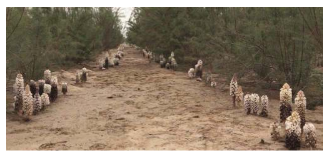
C. tubulosa – as cultivated - flowering for collection of seed

been isolated and identified, including 32 new ones. It is noteworthy that attention was paid to the polysaccharides in C. deserticola for the first time. A total of 17 new polysaccharides were purified, and six were found to have immunologic competence.